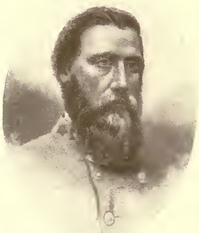
JOHN B. HOOD.